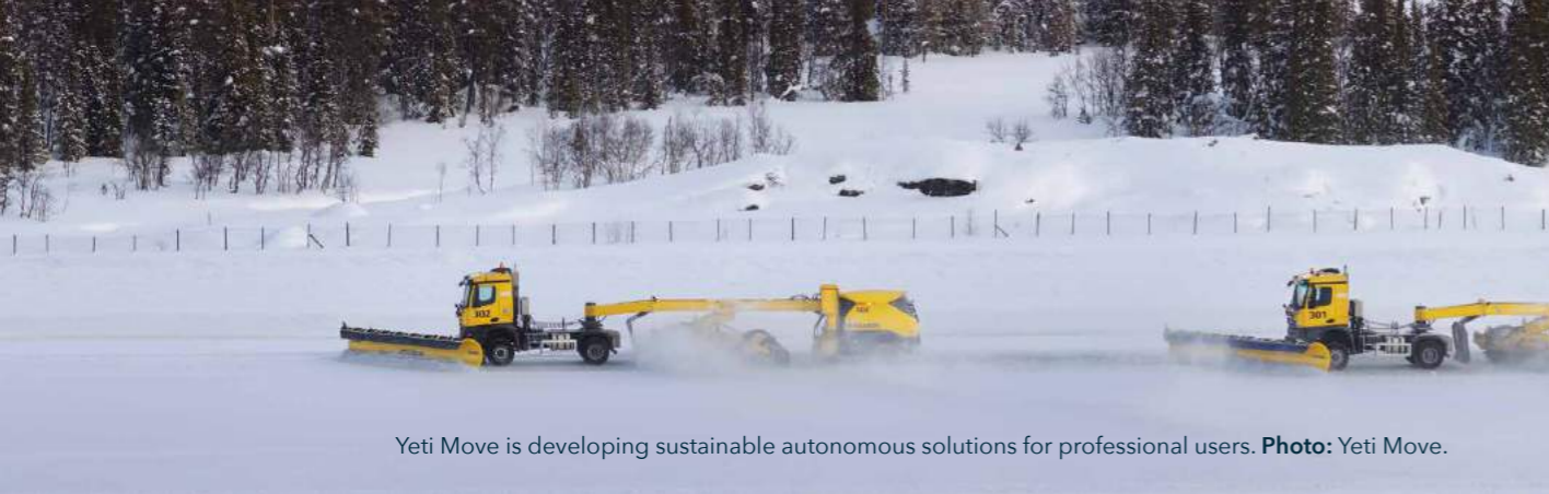
Yeti Move is developing sustainable autonomous solutions for professional users.