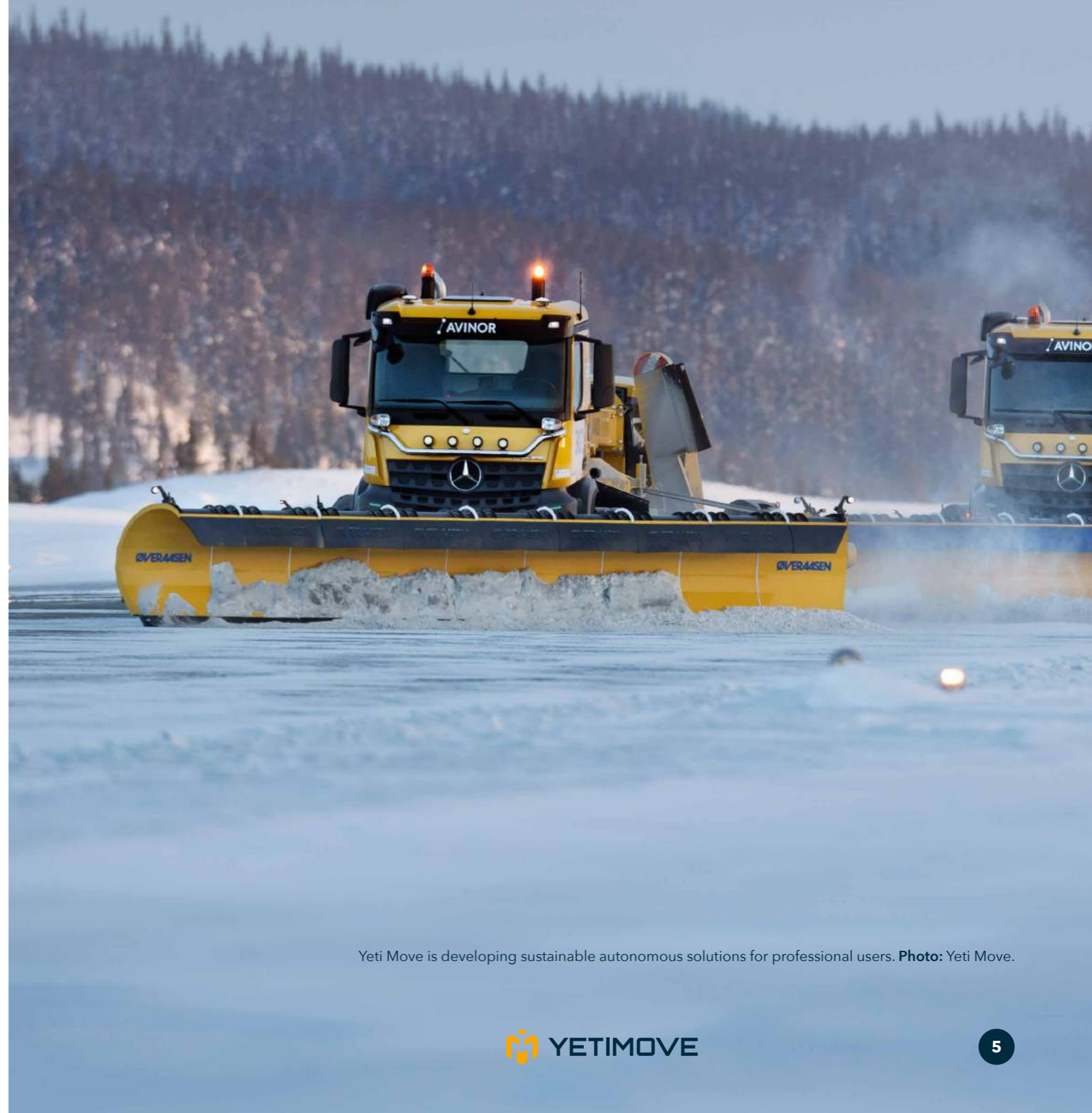
Yeti Move is developing sustainable autonomous solutions for professional users.